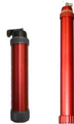
9012 / 9050 Container (Tube 600 ml)