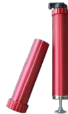
9011 Container, pneumatical