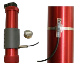
9020-9999 Magnetic-Sensor / 7002-0004 Limit-Sensor