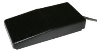
4472 Foot switch