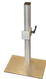
2400 Stand, small