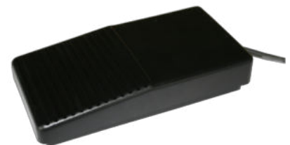
4472 Foot switch