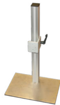
2400 Stand, small