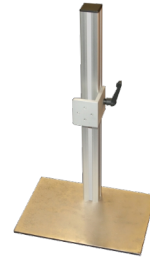
2400 Stand, small