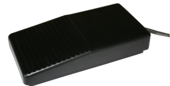
4472 Foot switch