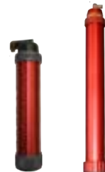
9012 / 9050 Container (Tube 600 ml)