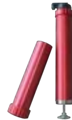
9011 Container, pneumatical