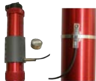
9020-9999 Magnetic-Sensor / 7002-0004 Limit-Sensor