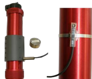
9020-9999 Magnetic-Sensor / 7002-0004 Limit-Sensor