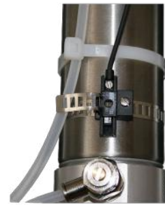
7002-0004 Level sensor