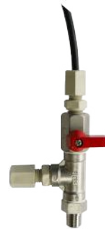
5015 2-Way ball valve