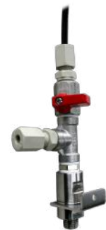
5015-02 Ball valve with quick release and safety sheet