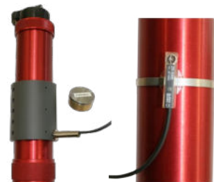
9020-9999 Magnetic-Sensor / 7002-0004 Limit-Sensor