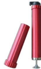
9011 Container, pneumatical