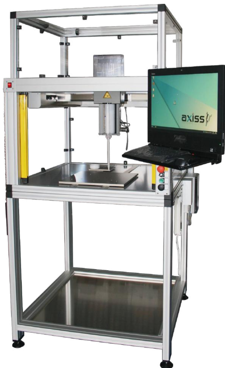
Image with Art. 3003 Substructure and Art. 3103 Hood