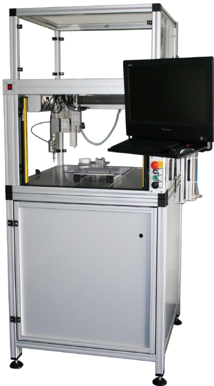
Image with Art. 3003 Substructure and Art. 3103 Hood