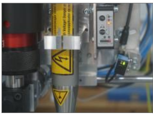
1528 Height sensor / Distance measurement