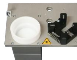
2510 Purging unit