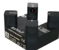
1523 Needle sensor