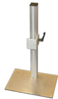
2400 Stand, small