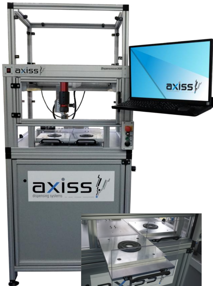
Image with Art. 3003 substructure and Art. 3103 Hood