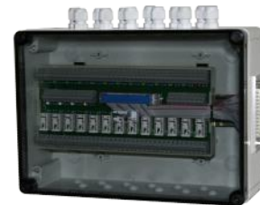
1701 Interface Card