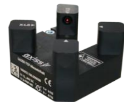
1523 Needle sensor