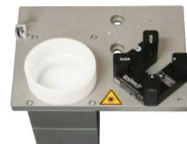
2510 Purging unit