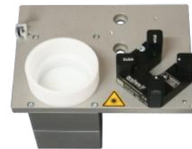
2510 Purging unit