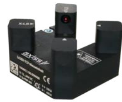
1523 Needle sensor