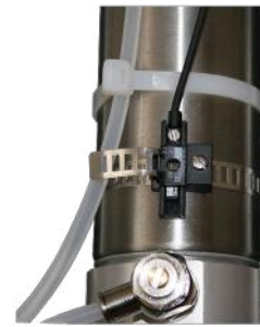
7002-0004 Level sensor