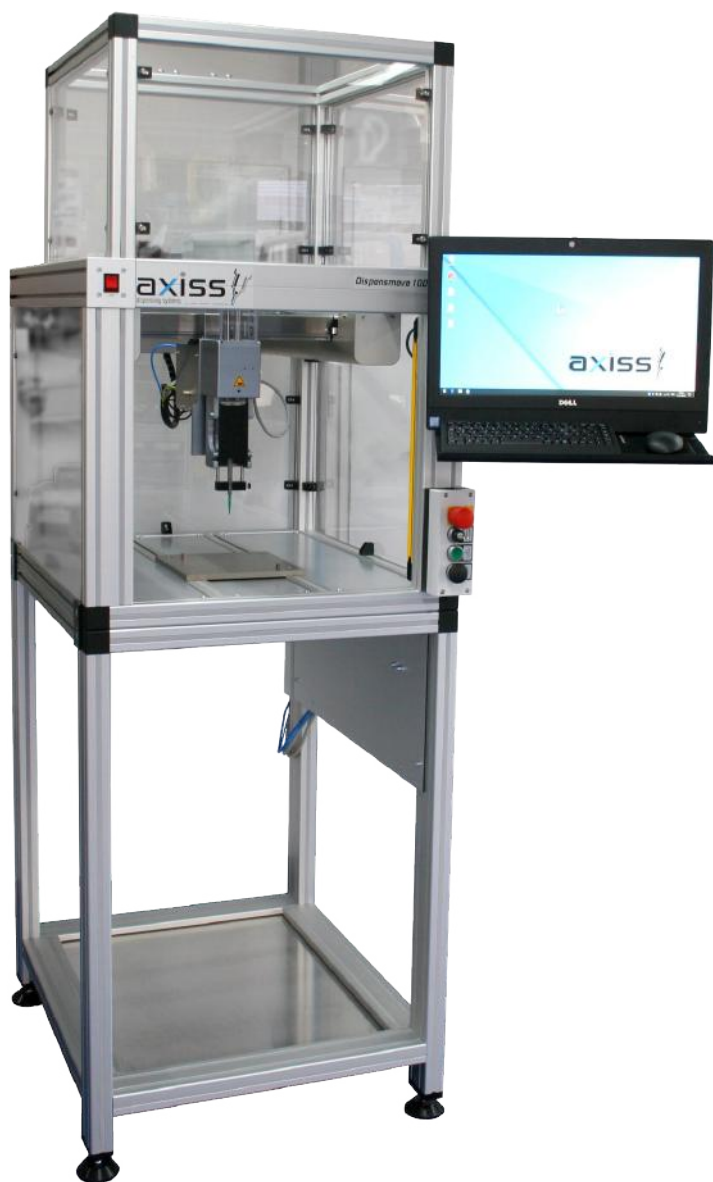
Image with Art. 3003 Substructure and Art. 3103 Hood